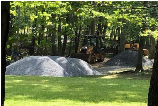
Tons of Gravel