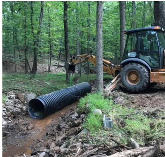
First of 5 culvert pipes

The many rainy days and weeks significantly delayed work in the Park over the summer. Nevertheless, a second pavilion was completed; the spring house demolished; road and pathway access upgraded; a walking path around the park completed; substantial debris removed, and electrical service installed in the larger pavilion. Some Partners, along with community volunteers, worked several days in the park for clean-up of large item debris, and grass cutting