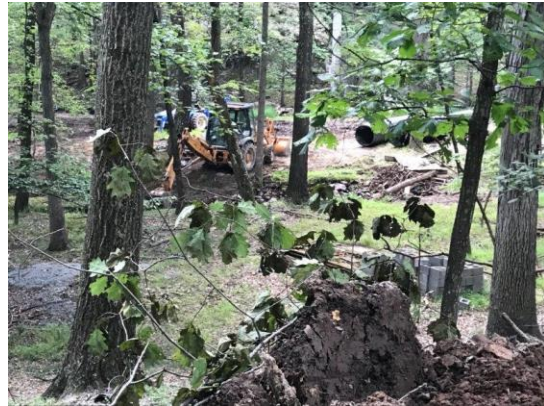
Installing 36 inch culverts for walking path across the creek