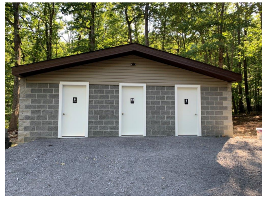
Newest Addition - Completed 2023

Winter Camp Park is being built and maintained solely with contributions of funding, time and talents of neighbors within The Woods community. The park is open to all Homeowners, Residents, and their Guests.