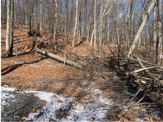
3 Down Trees and the Leaner!