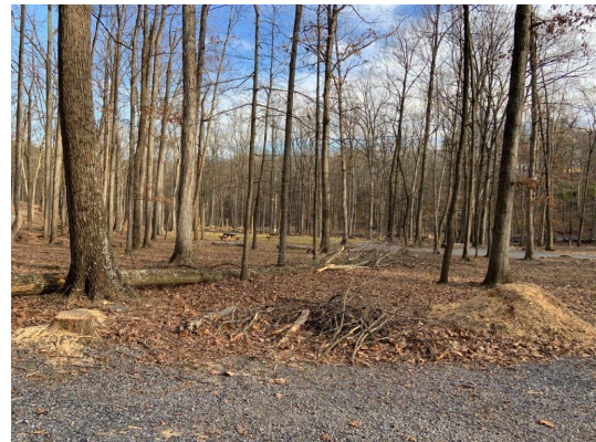
The length of the leaning tree was around 80+ feet.