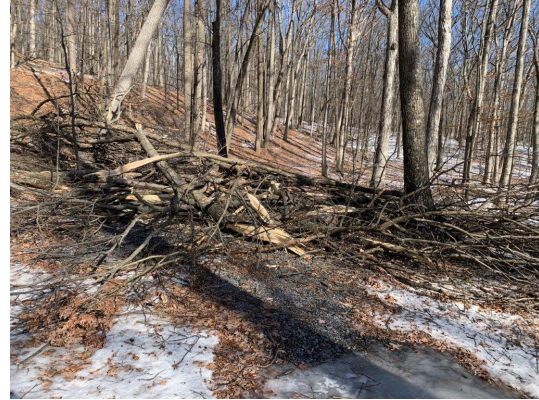
Down Trees Blocking the Pathway!